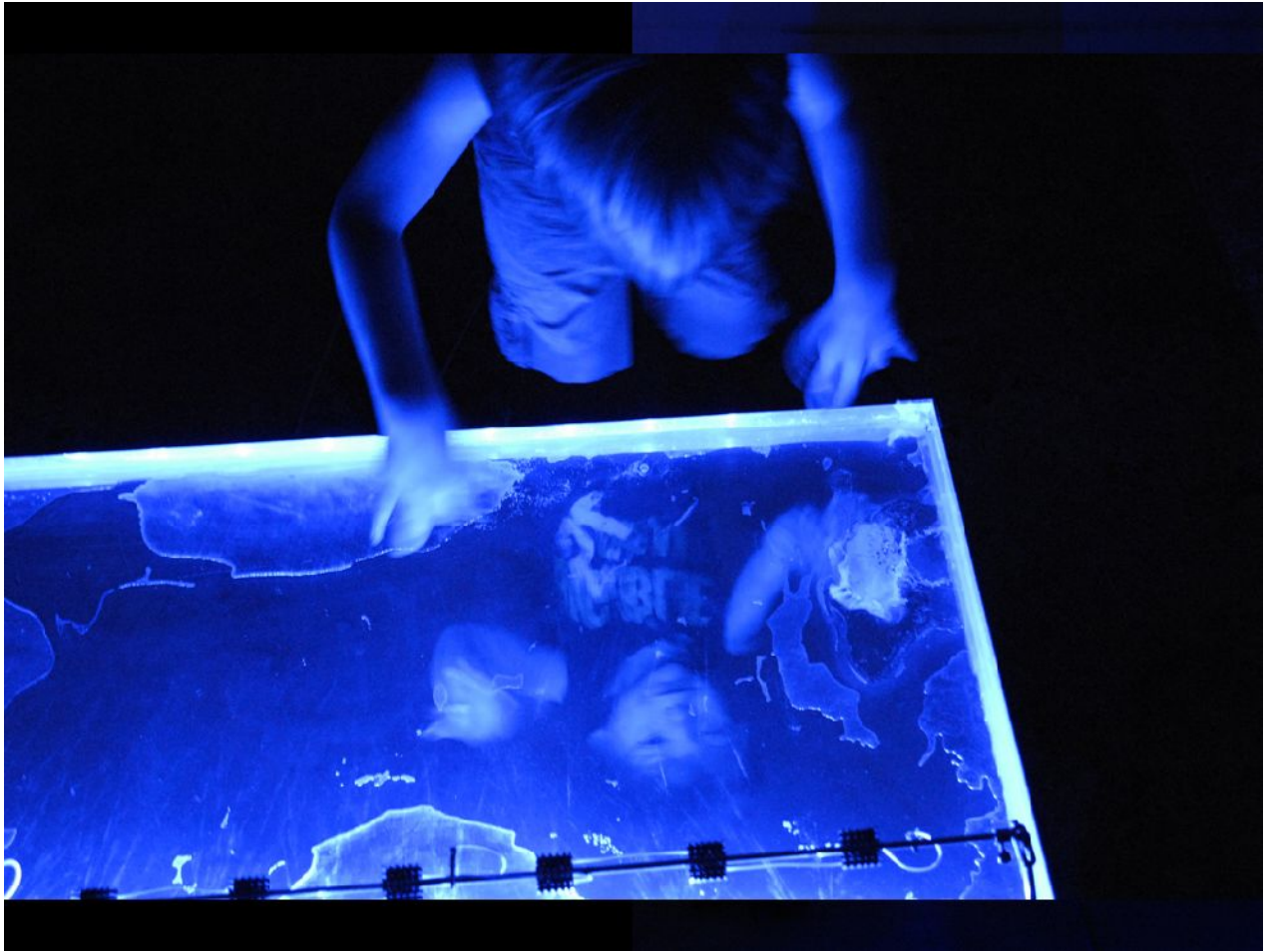
Specification sheet for delay~ / Etienne Rey